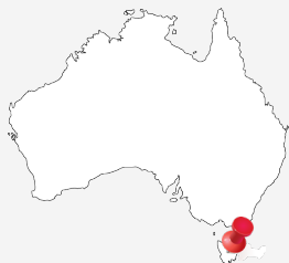
THE EDGE OF THE WORLD, TASMANIA

If you venture too far while you're down in Tasmania, you might find yourself at the Edge of the World! You'll be looking at the longest uninterrupted section of ocean on the planet. It might get a bit windy!